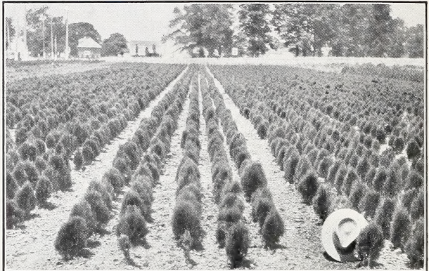
"Biota" Aurea Nana, July 11, 1929. Think of their eventual value!

Valuable sorts well-grown with mushroom manure. Set to the Nursery two (2) years ago, on transplanted understocks, from 2¼-in. pots. Wise up on these extra values, too!